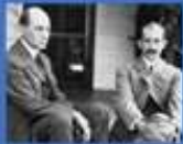
The Wright Brothers (Oliver & Wilbur)

American inventors who made the first flight in an aeroplane in 1901.