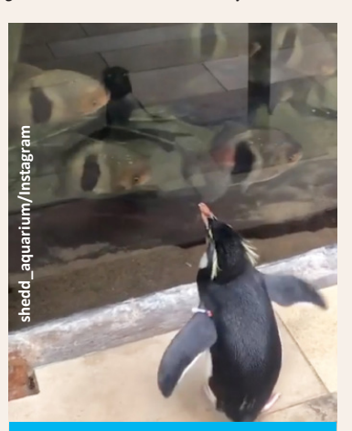
Wellington was fascinated by the piranhas in the Amazon section of the aquarium

We wonder if we'll get to see more animal fun online from other zoos, aquariums and animals centres?