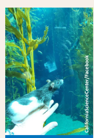
Rats got to explore the California Science Center