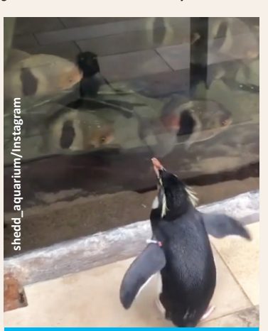
Wellington was fascinated by the piranhas in the Amazon section of the aquarium

We wonder if we'll get to see more animal fun online from other zoos, aquariums and animals centres?