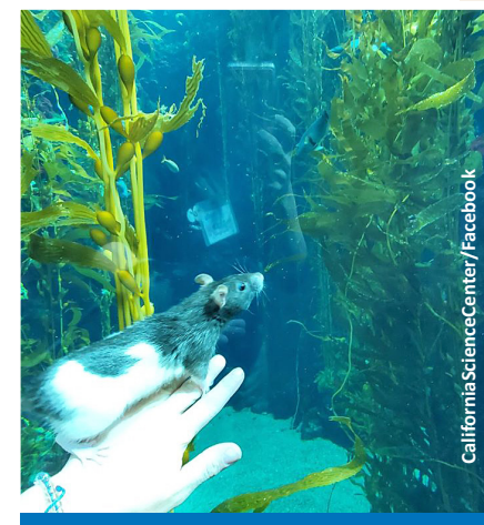
Rats got to explore the California Science Center