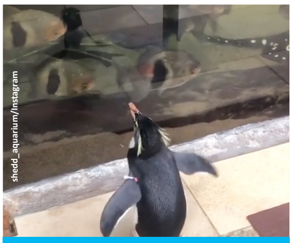
Wellington was fascinated by the piranhas in the Amazon section of the aquarium