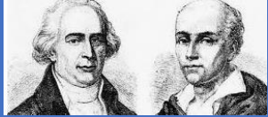
The Montgolfier Brothers (Joseph & Jacques)

French paper makers and inventors who invented the hot air balloon in 1783.