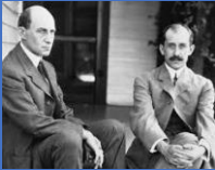
The Wright Brothers (Oliver & Wilbur)

American inventors who made the first flight in an aeroplane in 1901.