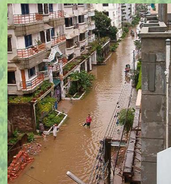
Flooding in Bangladesh