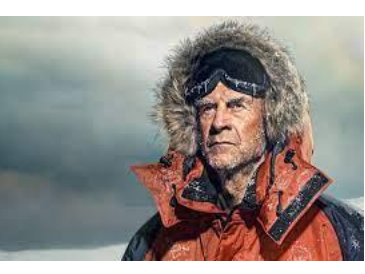
St. Agnes C of E Primary School Year One Summer 1 2023