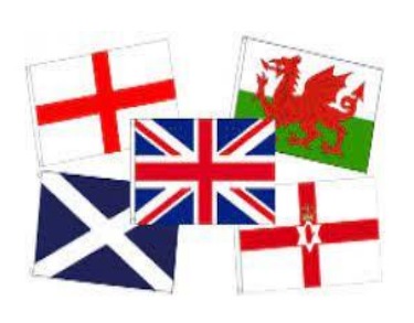
St. Agnes C of E Primary School Year One